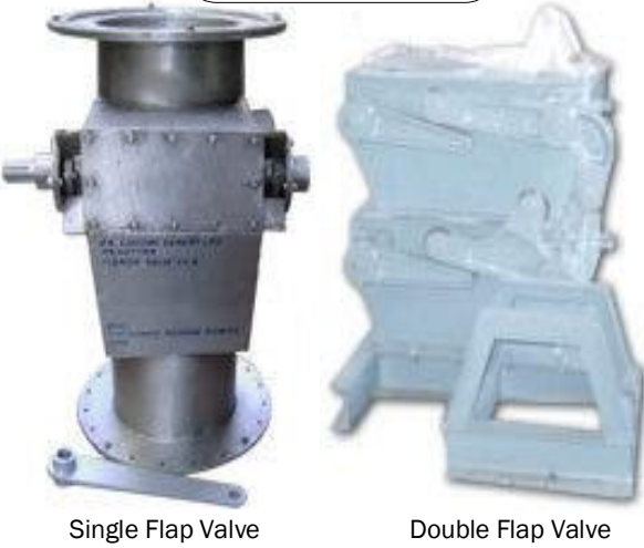
Single Flap Valve